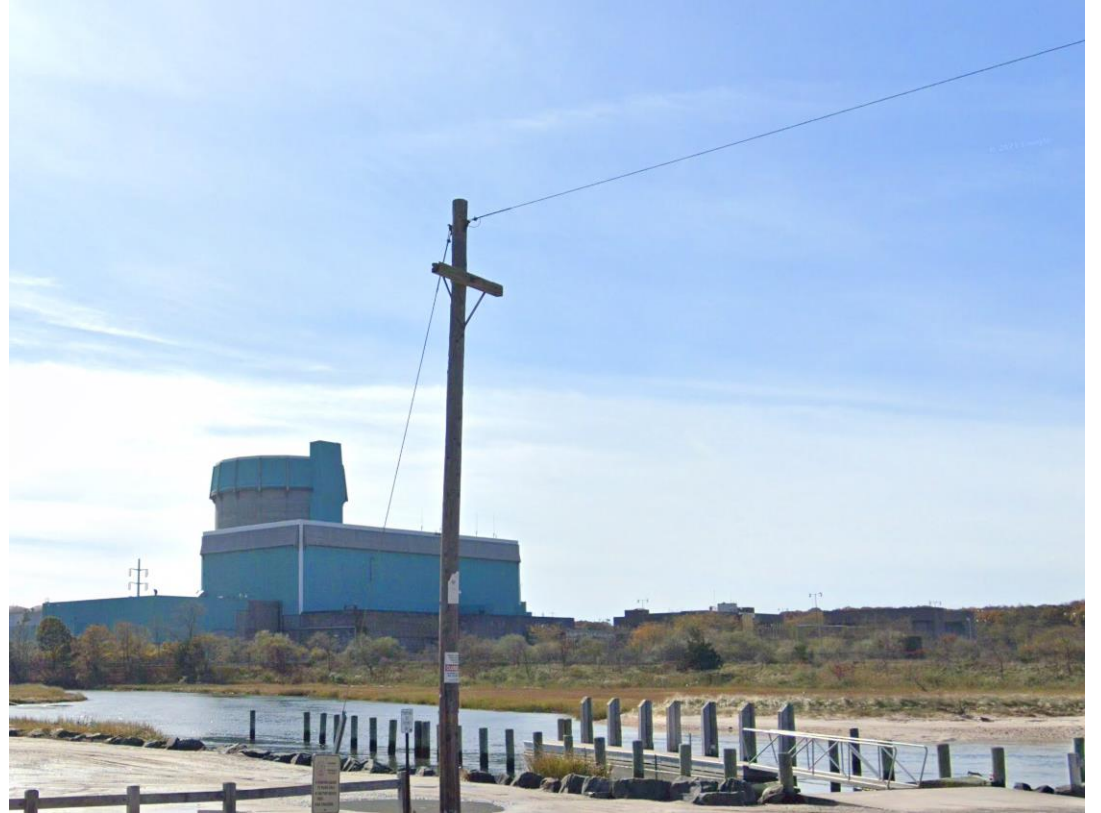
Figure D-3: Existing Conditions – View From Creek Road