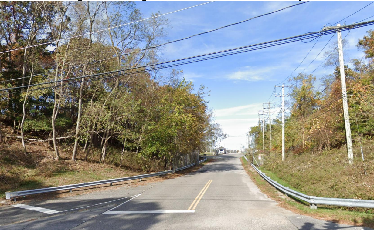
Figure D-2: Existing Conditions – View from Public Roadway